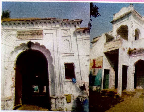
Maharaja Agrasen Balika Vidyalaya, Daliganj, Lucknow