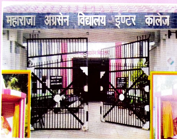
Maharaja Agrasen Inter College, Moti Nagar, Lucknow

Maharaja Agrasen Public School, Gomti Nagar, Lucknow