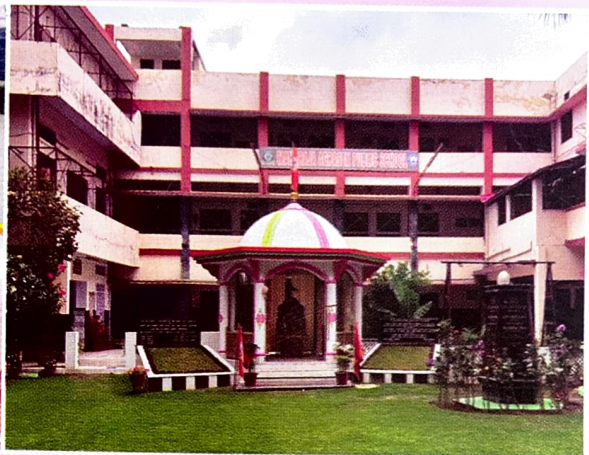
Maharaja Agrasen Public School, Moti Nagar, Lucknow