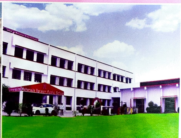
Maharaja Agrasen Public School, Jankipuram, Lucknow